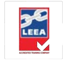
LEEA Lifting Equipment Engineers Association (UK)