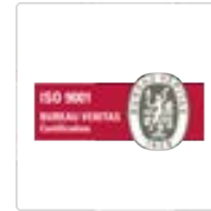
ISO 9001 Bureau Veritas ISO 9001:2008