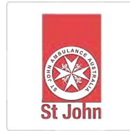
ST JOHN St John Ambulance (AUS)