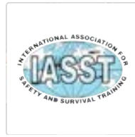
IASST International Association for Safety and Surviving Training (UK)