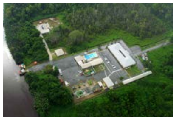
Megamas Training Company Head Office Kuala Belait, Brunei

A branch office has been recently opened in Singapore.